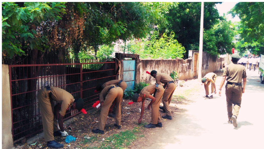
1 COY 8 (TN) BN NCC GOVERNMENT ARTS COLLEGE (AUTONOMOUS) KUMBAKONAM